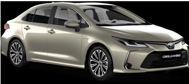
4. Toyota Corolla 32.958