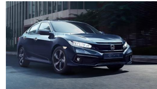
6. Honda Civic 19.885