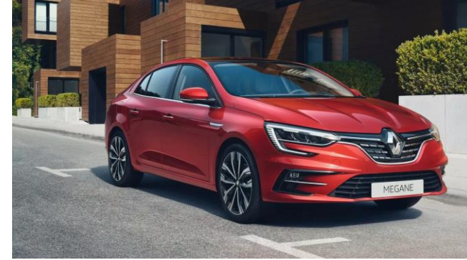
3. Renault Megane Sedan 39.917