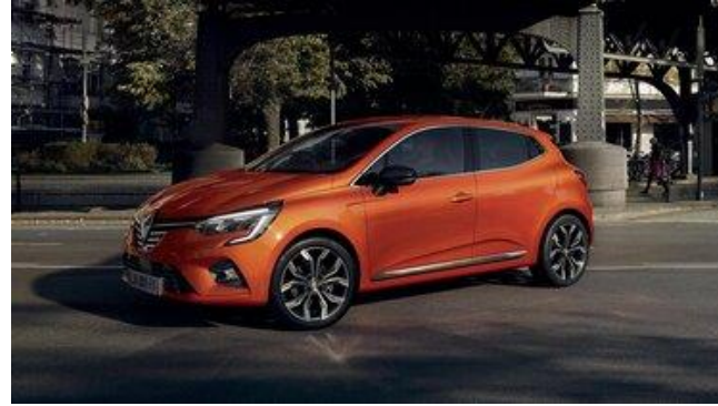
2. Renault Clio 46.192