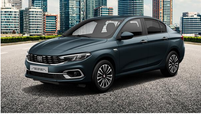
1. Fiat Egea (Tipo) Sedan 79.556