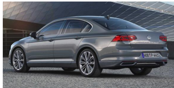
5. Volkswagen Passat 22.452