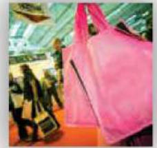
Visitor's Bag Partner