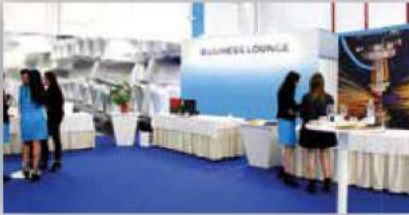
Business Lounge Partner

Partnership options are limited, please contact sales.iotindia@singex.com now!